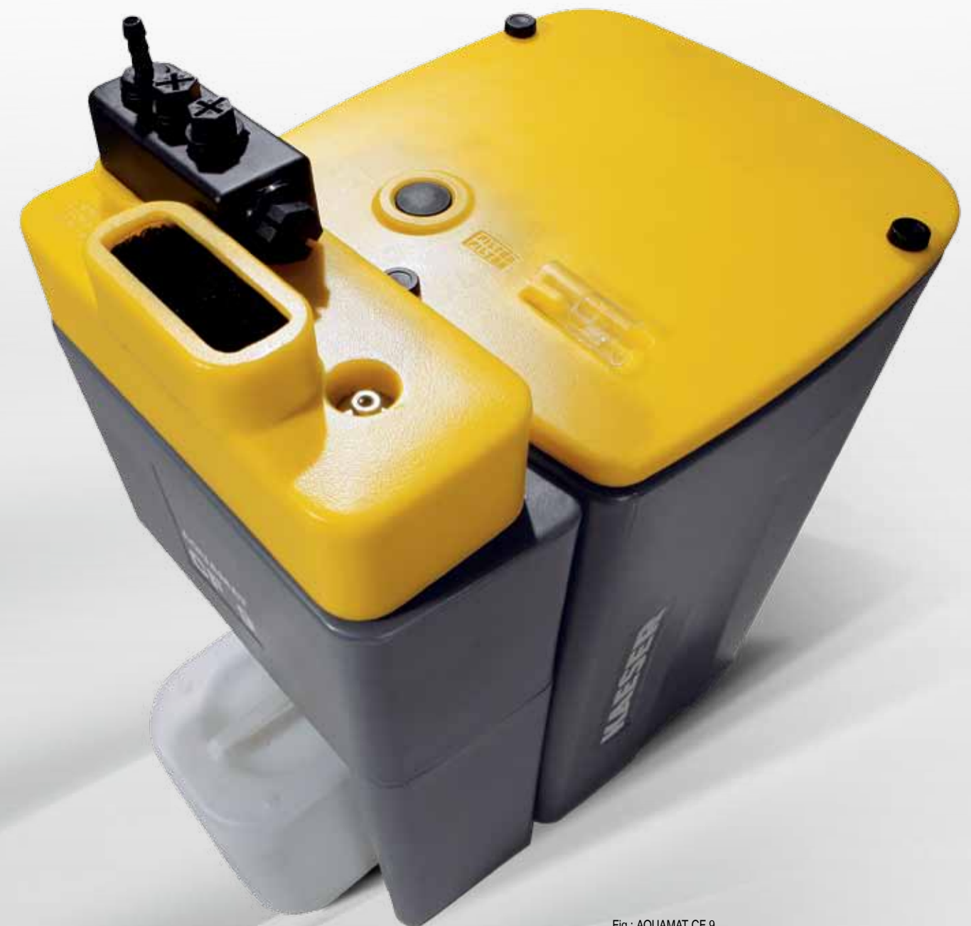
Fig.: AQUAMAT CF 9